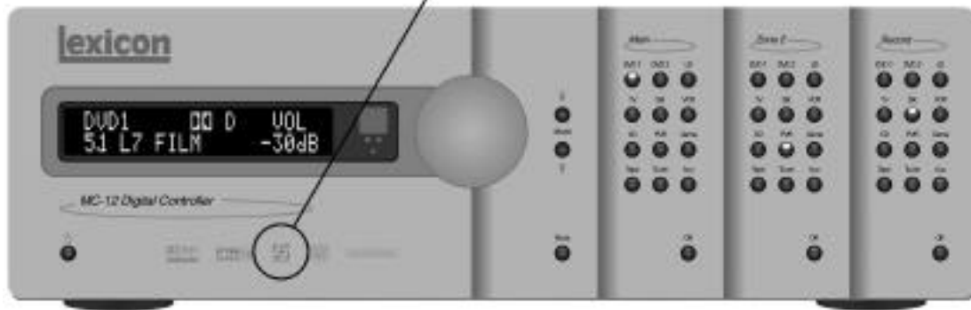
LOGIC7 Logo displayed at minimum size on product front panel

On hardware and software products, place the LOGIC7 logo in a subordinate position to the primary company or product identity, as shown below.