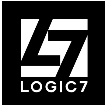
white version on black background