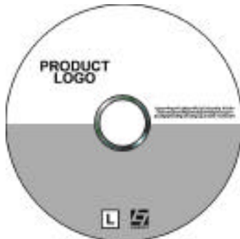
LOGIC7 Logo displayed upon a gray background